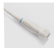
P4-2s 1.3-4.7MHz Phased Array