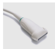
L13-3s 3-13MHz Linear