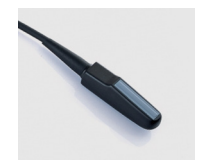
6LE5Vs 5-8MHz Endorectal

Complete your M8 machine with our extensive range of transducers and accessories. Visit www.bcfultrasound.com