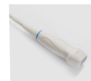
P10-4s 2.9-10.5MHz Phased Array