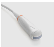
C11-3s 3-11.2MHz Micro Convex