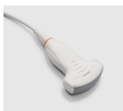
C5-1s 1.4-5.1MHz Convex